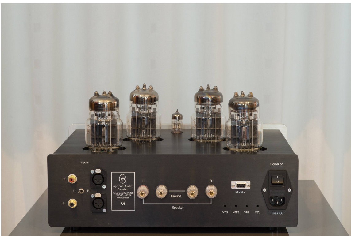
Fig 2 Rear view