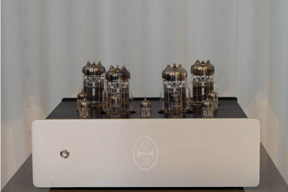
Fig 1 Front view